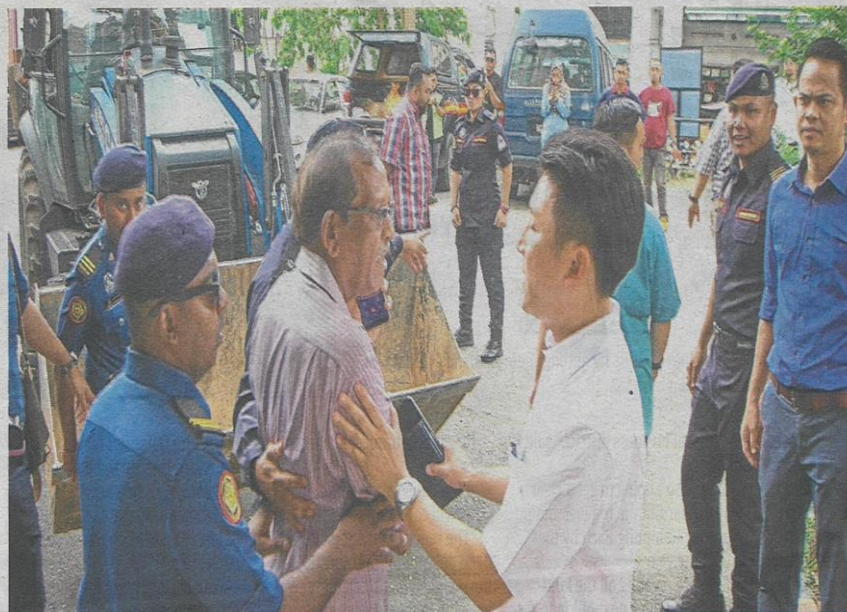
Ng (in white shirt) and enforcement officers advising a man to move away from the path of an excavator used to demolish the illegal structures.

MPS removes structures obstructing parking bays and traffic flow