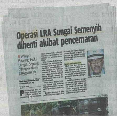
Keratan akhbar BH 27 Jun lalu.

LRA Sungai Semenyih beroperasi semula pada jam 6 pagi, 27 Jun lalu.