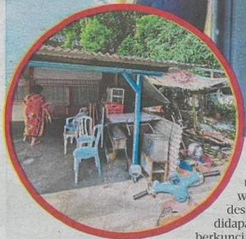
ANTARA premis perniagaan milik warga asing yang disita dalam operasi bersepadu MPSJ.